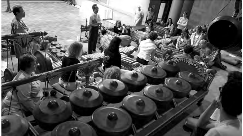
Wesleyan Gamelan Ensemble, see page 14