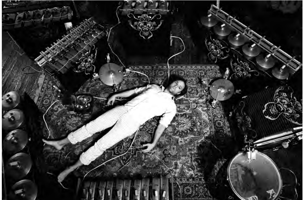
The Gamelatron Project, see page 10