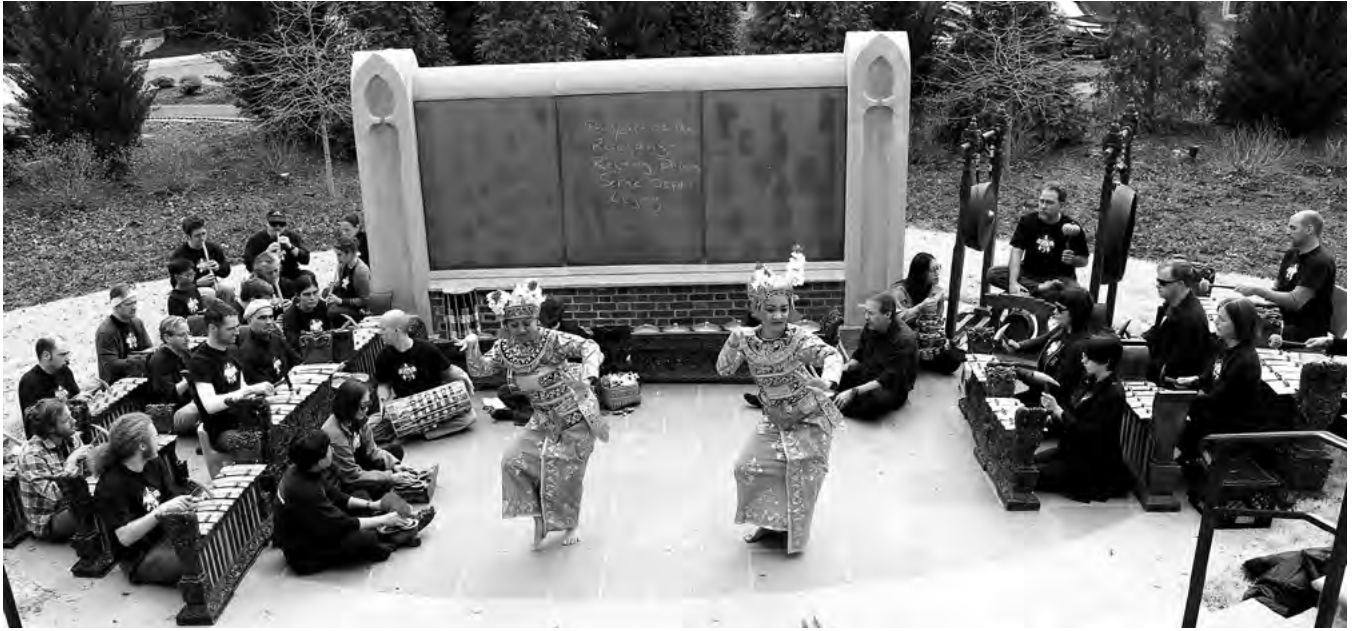
Gamelan Raga Kusuma, see page 11