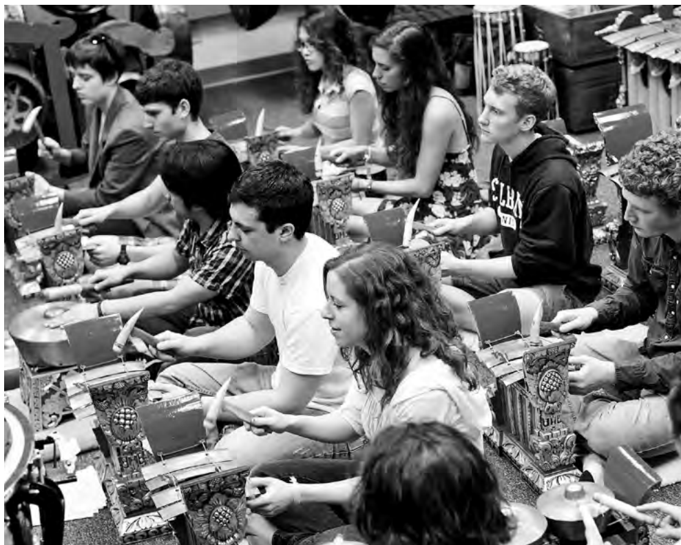
Bucknell Gamelan Ensemble, see page 10

SATURDAY, NOVEMBER 2 Freer conference room