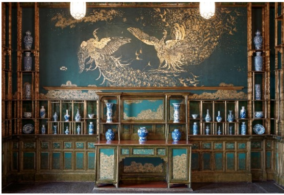
The Peacock Room in Blue and White James McNeill Whistler (1834–1903) Oil paint and gold leaf on canvas, leather, and wood Gift of Charles Lang Freer, Freer Gallery of Art, F1904.61