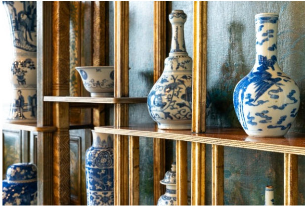
The shelves of the Peacock Room with blue-and-white Chinese porcelain