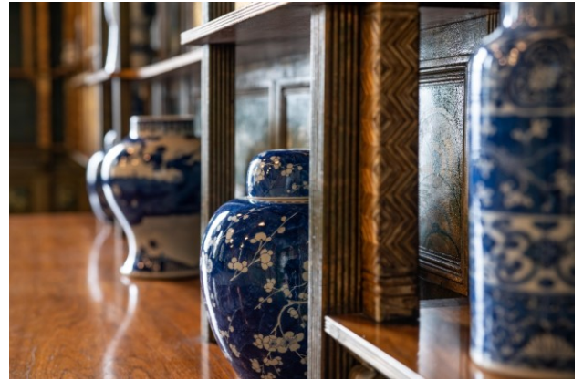
The shelves of the Peacock Room with blue-and-white Chinese porcelain