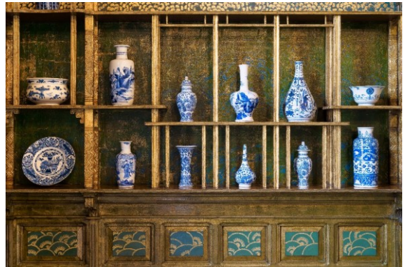
The Peacock Room in Blue and White James McNeill Whistler (1834–1903) Oil paint and gold leaf on canvas, leather, and wood Gift of Charles Lang Freer, Freer Gallery of Art, F1904.61