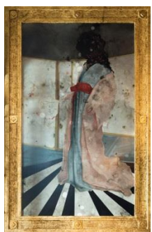
Darren Waterston Filthy Lucre , 2013–14 Oil, acrylic, and gold leaf on wood, aluminum, fiberglass, and ceramic, with audio and lighting components. Approximately 146 x 366 x 238 inches Courtesy the artist and DC Moore Gallery, New York Installation view, MASS MoCA, North Adams, MA Photo: Amber Gray, courtesy MASS MoCA