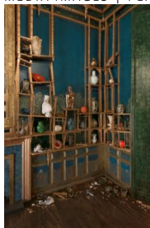
Darren Waterston Filthy Lucre , 2013–14 Oil, acrylic, and gold leaf on wood, aluminum, fiberglass, and ceramic, with audio and lighting components. Approximately 146 x 366 x 238 inches Courtesy the artist and DC Moore Gallery, New York Installation view, MASS MoCA, North Adams, MA