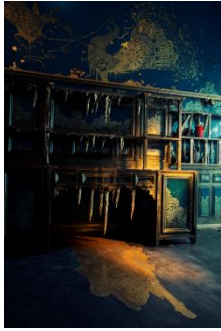
Darren Waterston Filthy Lucre , 2013–14 Oil, acrylic, and gold leaf on wood, aluminum, fiberglass, and ceramic, with audio and lighting components. Approximately 146 x 366 x 238 inches Courtesy the artist and DC Moore Gallery, New York Installation view, MASS MoCA, North Adams, MA Photo: Amber Gray, courtesy MASS MoCA