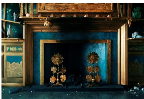
Darren Waterston Filthy Lucre , 2013–14 Oil, acrylic, and gold leaf on wood, aluminum, fiberglass, and ceramic, with audio and lighting components. Approximately 146 x 366 x 238 inches Courtesy the artist and DC Moore Gallery, New York Installation view, MASS MoCA, North Adams, MA