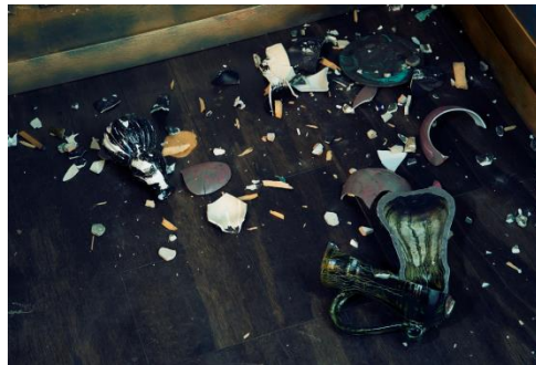
Darren Waterston Filthy Lucre , 2013–14 Oil, acrylic, and gold leaf on wood, aluminum, fiberglass, and ceramic, with audio and lighting components. Approximately 146 x 366 x 238 inches Courtesy the artist and DC Moore Gallery, New York Installation view, MASS MoCA, North Adams, MA Photo: Amber Gray, courtesy MASS MoCA