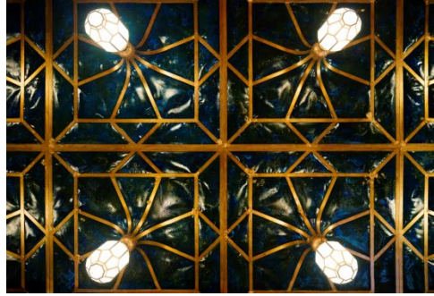
Darren Waterston Filthy Lucre , 2013–14 Oil, acrylic, and gold leaf on wood, aluminum, fiberglass, and ceramic, with audio and lighting components. Approximately 146 x 366 x 238 inches Courtesy the artist and DC Moore Gallery, New York Installation view, MASS MoCA, North Adams, MA