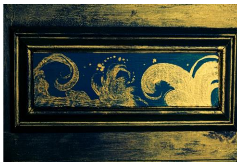
Darren Waterston Filthy Lucre , 2013–14 Oil, acrylic, and gold leaf on wood, aluminum, fiberglass, and ceramic, with audio and lighting components. Approximately 146 x 366 x 238 inches Courtesy the artist and DC Moore Gallery, New York Installation view, MASS MoCA, North Adams, MA