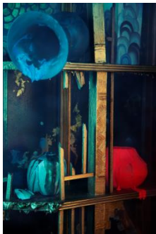
Darren Waterston Filthy Lucre , 2013–14 Oil, acrylic, and gold leaf on wood, aluminum, fiberglass, and ceramic, with audio and lighting components. Approximately 146 x 366 x 238 inches Courtesy the artist and DC Moore Gallery, New York Installation view, MASS MoCA, North Adams, MA