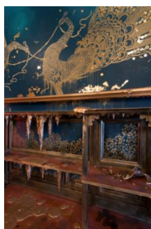
Darren Waterston Filthy Lucre , 2013–14 Oil, acrylic, and gold leaf on wood, aluminum, fiberglass, and ceramic, with audio and lighting components. Approximately 146 x 366 x 238 inches Courtesy the artist and DC Moore Gallery, New York Installation view, MASS MoCA, North Adams, MA