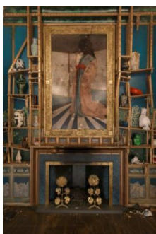
Darren Waterston Filthy Lucre , 2013–14 Oil, acrylic, and gold leaf on wood, aluminum, fiberglass, and ceramic, with audio and lighting components. Approximately 146 x 366 x 238 inches Courtesy the artist and DC Moore Gallery, New York Installation view, MASS MoCA, North Adams, MA