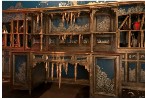
Darren Waterston Filthy Lucre , 2013–14 Oil, acrylic, and gold leaf on wood, aluminum, fiberglass, and ceramic, with audio and lighting components. Approximately 146 x 366 x 238 inches Installation view, MASS MoCA, North Adams, MA