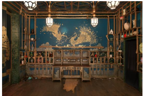
Darren Waterston Filthy Lucre , 2013–14 Oil, acrylic, and gold leaf on wood, aluminum, fiberglass, and ceramic, with audio and lighting components. Approximately 146 x 366 x 238 inches Courtesy the artist and DC Moore Gallery, New York Installation view, MASS MoCA, North Adams, MA Photo: John Tsantes