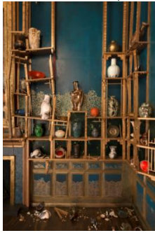
Darren Waterston Filthy Lucre , 2013–14 Oil, acrylic, and gold leaf on wood, aluminum, fiberglass, and ceramic, with audio and lighting components. Approximately 146 x 366 x 238 inches Courtesy the artist and DC Moore Gallery, New York Installation view, MASS MoCA, North Adams, MA Photo: John Tsantes