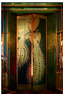
Darren Waterston Filthy Lucre , 2013–14 Oil, acrylic, and gold leaf on wood, aluminum, fiberglass, and ceramic, with audio and lighting components. Approximately 146 x 366 x 238 inches Courtesy the artist and DC Moore Gallery, New York Installation view, MASS MoCA, North Adams, MA Photo: Amber Gray, courtesy MASS MoCA