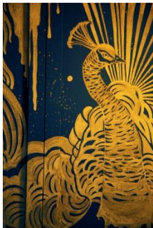
Darren Waterston Filthy Lucre , 2013–14 Oil, acrylic, and gold leaf on wood, aluminum, fiberglass, and ceramic, with audio and lighting components. Approximately 146 x 366 x 238 inches Courtesy the artist and DC Moore Gallery, New York Installation view, MASS MoCA, North Adams, MA Photo: Amber Gray, courtesy MASS MoCA