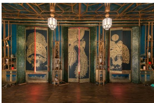
Darren Waterston Filthy Lucre , 2013–14 Oil, acrylic, and gold leaf on wood, aluminum, fiberglass, and ceramic, with audio and lighting components. Approximately 146 x 366 x 238 inches Courtesy the artist and DC Moore Gallery, New York Installation view, MASS MoCA, North Adams, MA Photo: John Tsantes