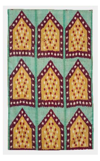
Wall hanging Central Asia, 1875–1900 Silk, cotton, and wool Gift of Guido Goldman S2004.82

Complete loom length Central Asia, 19th century Silk velvet Gift of Guido Goldman S2004.78